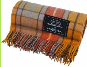
Recycled Wool Scottish Tartan Blanket Autumn