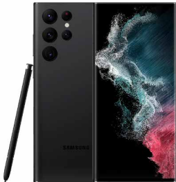
Samsung Galaxy S22 Ultra 128GB Phantom Black