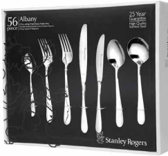
Stanley Rogers Albany Cutlery Set 56 Piece