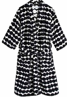
Marimekko Räsymatto Bathrobe