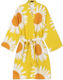
Marimekko Auringonkukka Beach Robe