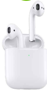
Apple AirPods 2nd Generation