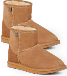
EMU Platinum Stinger Mini Boots