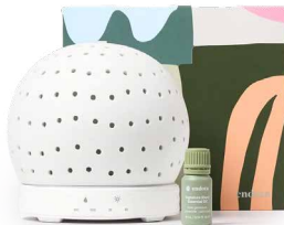
Endota Mindful Moments