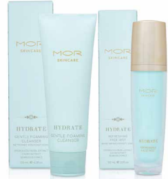
MOR Refreshing Face Mist and Gentle Cleanser Pack