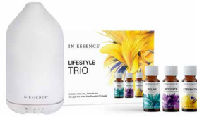
In Essence Lifestyles Trio & Taro Diffuser Set