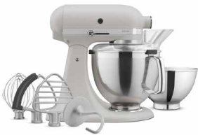
KitchenAid Artisan KSM195 Tilt Head Mixer Milkshake