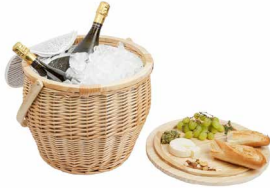
Sunnylife Round Picnic Cooler Basket Natural