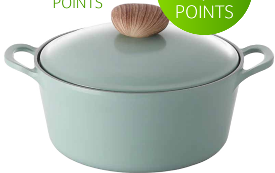
Neoflam Retro 22cm Stockpot Induction with Die-Cast Lid