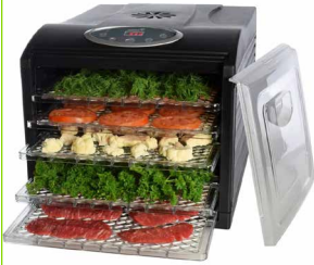
Sunbeam Food Lab Electronic Food Dehydrator Black