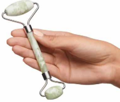
Endota Spa Live Well Facial Roller