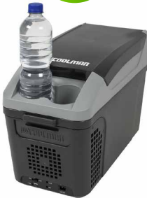
MyCOOLMAN CTP10 9.5L The Commuter Thermometric Cooler Warmer