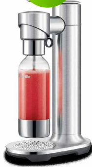
Breville The Infizz Fusion