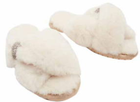
EMU Women's Mayberry Crystal Slippers Natural