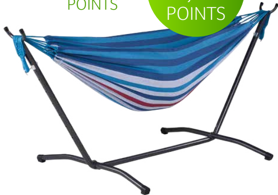
Oztrail Anywhere Hammock Double with Steel Frame