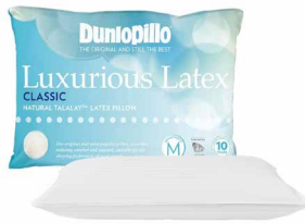
Dunlopillo Luxurious Latex Medium Profile and Feel Classic Pillow White