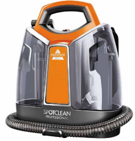
Bissell Spotclean Professional Carpet And Upholstery Cleaner