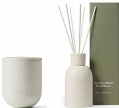
Signature Reed Diffuser & Candle Pack