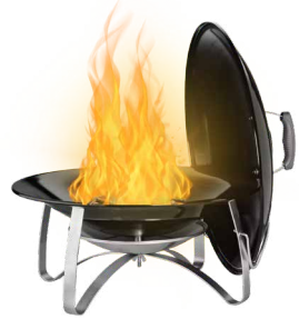
Weber Fire Pit