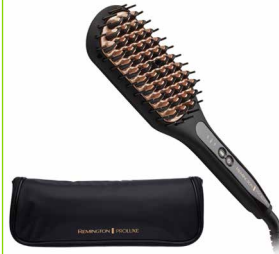
Remington Proluxe Salon Ionic Straightening Brush