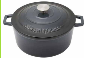
Westinghouse Cast Iron Pot, Ombre Grey, 25cm Round