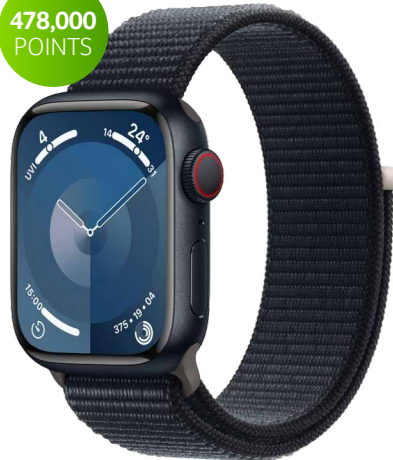
Apple Watch Series 9 GPS + Cellular 41mm