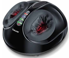
Beurer Foot Massager FM90