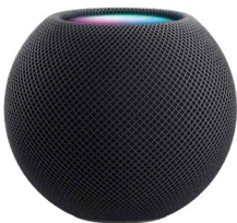
Apple HomePod Mini SSpace Grey