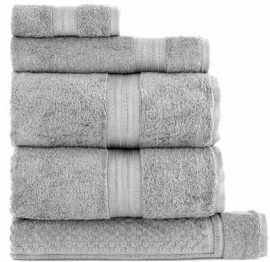
Sheraton Egyptian 5 Piece Towel Pack Dove Grey