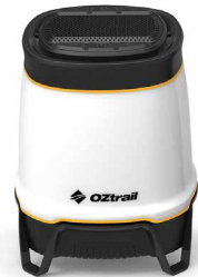
Oztrail Ignite Bluetooth Speaker Lantern