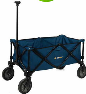
Oztrail Collapsible Camp Wagon Blue