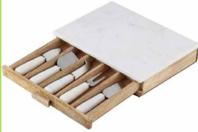
Academy Eliot Cheese Knife & Board 6 Piece Set