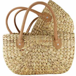
Robert Gordon Rectangular Harvest Bags with Suede Handle