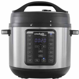
Sunbeam Crock Pot Multi Express Crock XL