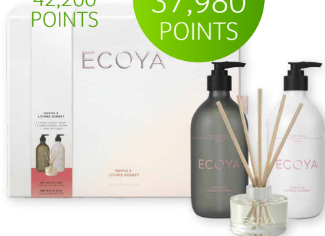
Guava & Lychee Sorbet Hand and Body Wash & Lotion Set with Mini Diffuser