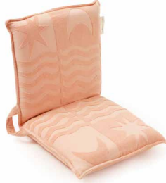
Terry Travel Lounger Salmon