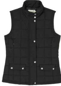
R.M. Williams Wilpena Creek Vest Black