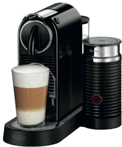
Delonghi Nespresso Citiz & Milk Coffee Machine Black