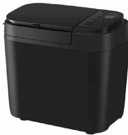
Panasonic Bread Maker