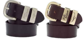
R.M. Williams 1 1/2 Inch 3 Piece Solid Hide Chestnut or Black