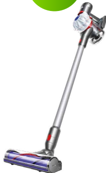
Dyson V8 Cordfree Vacuum